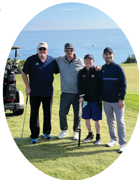
Mulgrave Country Club