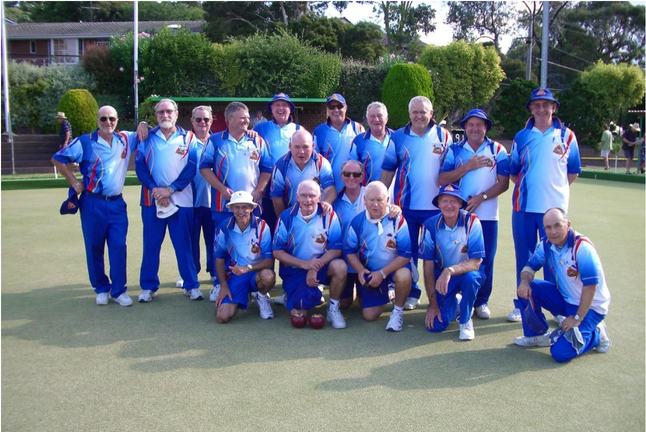
Photo: Our Weekend Pennant Side 1 (season 2012/13) celebrates winning their Division 2 Quarter Final against Mitcham. This followed winning promotion the previous week to Division 1 for season 2013/14.