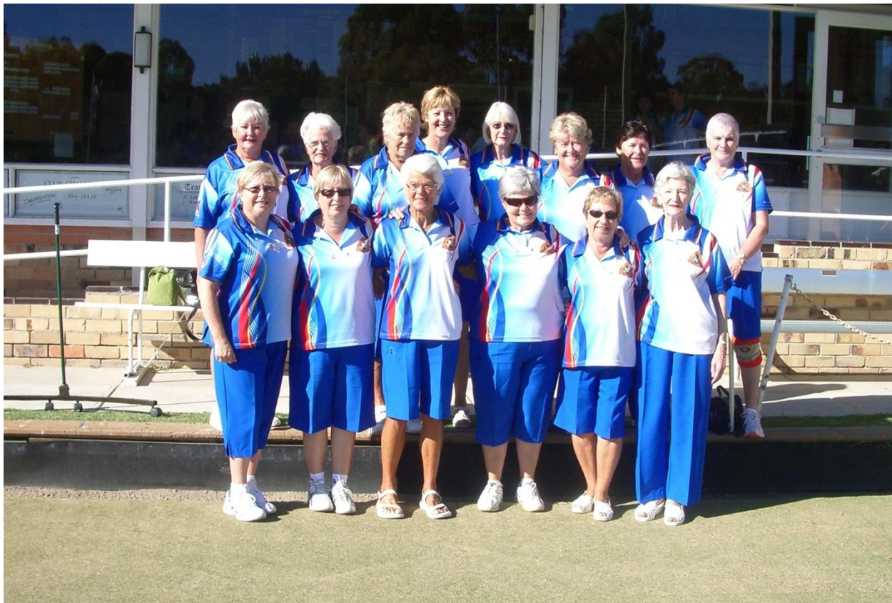
Photo: Our Midweek Women's Only Pennant Side 1 (season 2012/2013) celebrates winning their Division 1 Quarter Final at Bennestwood

You get the opportunity to play in different positions, learn the scoring and measuring procedure and hopefully get the opportunity to act as a "skip". This gives you an overview and an appreciation of the importance of each player and the level of concentration needed.